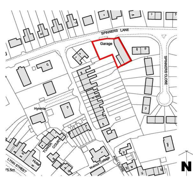
LOCATION PLAN SCALE 1:1250 Project : Proposed Residential Development, Spinners Lane Garage, Swaffham, PE37 7LR Client : Mr Phillip Wattam Title : Site & Location Plan Revision Details : Issue Date : 13/02/2018