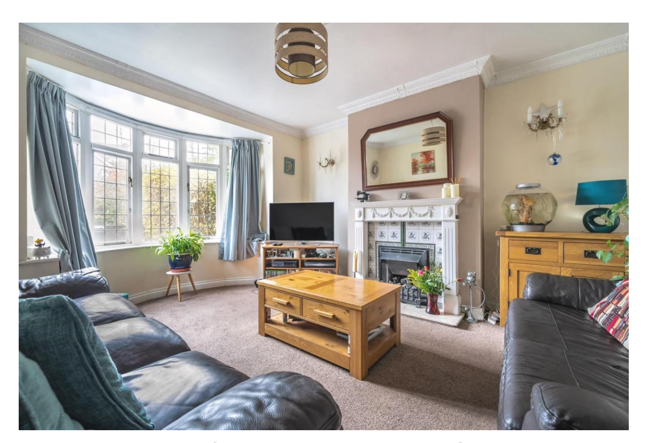
72 Woodcote Road, Caversham Heights, Reading, RG4 7EX Price £580,000 Freehold

Masons are proud to offer to the market this attractive and extended three/four bedroom semi-detached, located on a sought after road Caversham Heights and close to Caversham & Reading centres, along with Reading mainline station. The property is presented in good order throughout and its from a 15ft living room, a 22ft dining room, a 16ft kitchen, a utility room and a 12ft bedroom four/reception three. Further benefits include annex potential, three further bedrooms, a master bedroom with ensuite, an additional bathroom, a large rear garden, garage and off road parking. Viewing recommended.