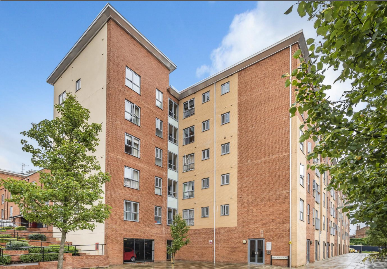
Flat 5 Englefield House, Reading, Berkshire, RG30 1ET O.I.E.O. £200,000 Leasehold

10 Bridge Street, Caversham, Reading RG4 8AA t 0118 946 1140 e sales@masonsestateagents.com