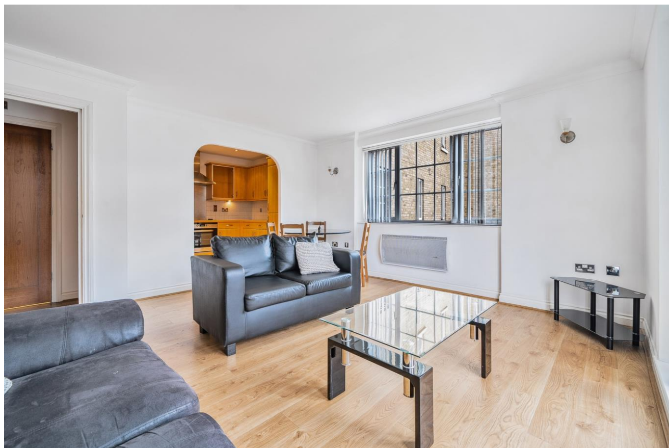
18 Riverside House, Reading, Berkshire, RG1 6BH Price £315,000 Leasehold

Masons are proud to offer to the market this immaculately presented, two bedroom, executive second floor apartment situated in a riverside complex on a sought after road in Reading Town Centre, within walking distance of a plethora of shops and amenities as well as Reading mainline station. The property boasts great transport links to the M4 Motorway and has spacious accommodation comprising of a 14ft living/dining room, a 9ft kitchen, a 7ft balcony, a 12ft master bedroom with en-suite shower room, a 9ft second bedroom, a three piece bathroom and two storage cupboards. Further benefits of the property include a long lease of approx. 977 years remaining, UPVC double glazing, lift access, a video entry system, secure allocated parking and the property is offered for sale with NO ONWARD CHAIN. VIEWING RECOMMENDED.