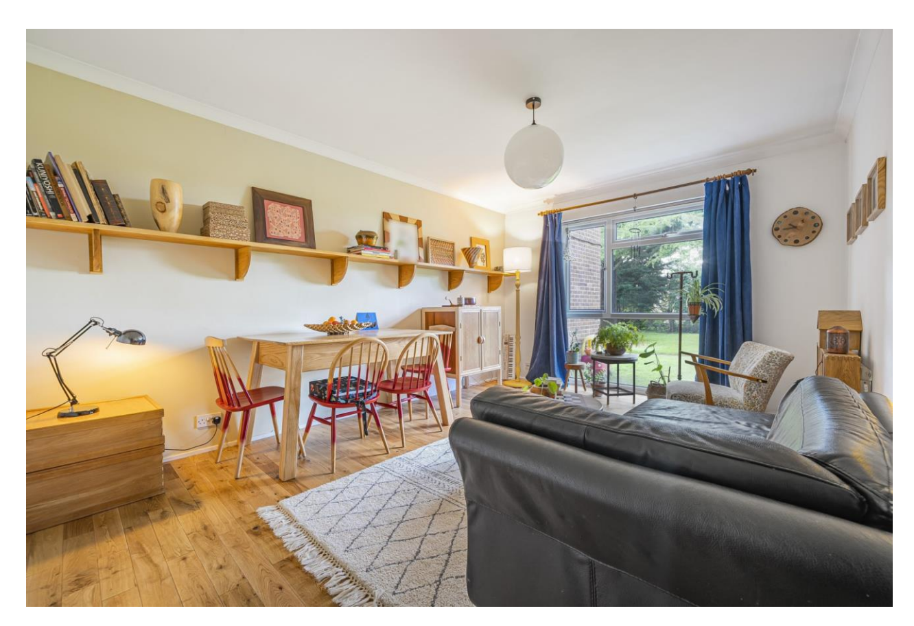
7 Beacon Court Southcote Road, West Reading, Reading, RG30 2ER Price £250.000 Leasehold

Masons are proud to offer to the market this two bedroom ground floor apartment situated on a sought after road close to Reading Town Centre and mainline station. Having undergone major improvements by the current owners including a new kitchen, new flooring, new water cylinder and extensive redecoration throughout, the property is offered for sale in excellent condition. The accommodation comprises of a 14ft living/dining room, an 11ft modern kitchen, a 14ft master bedroom, a 10ft second bedroom and a family bathroom. Further benefits of this property include a lease length of approx. 143 years remaining, a garage as well as off road parking, generous communal gardens and UPVC double glazing. VIEWING RECOMMENDED.