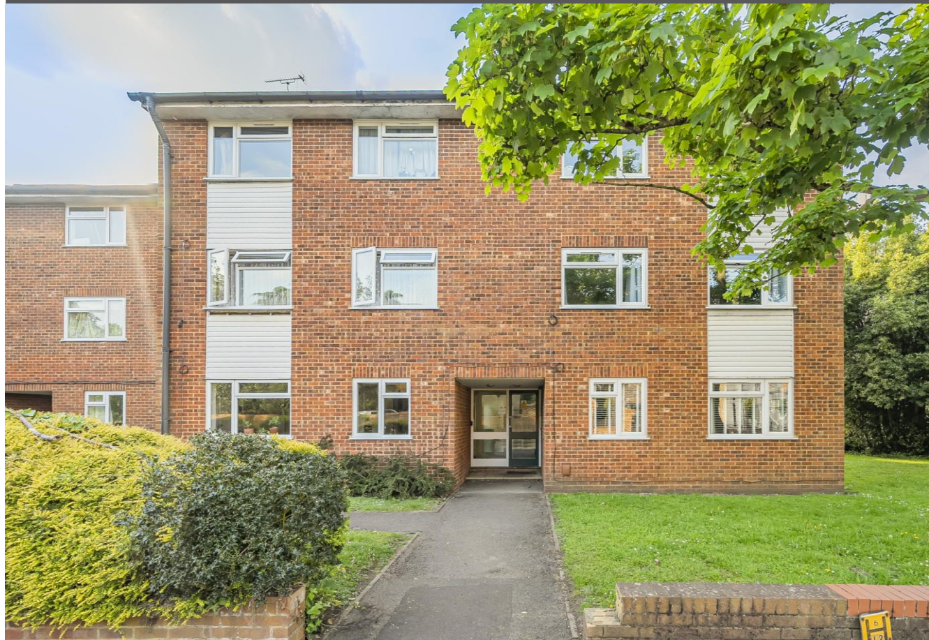
7 Beacon Court, Southcote Road, West Reading, Reading, RG30 2ER Price £250,000 Leasehold