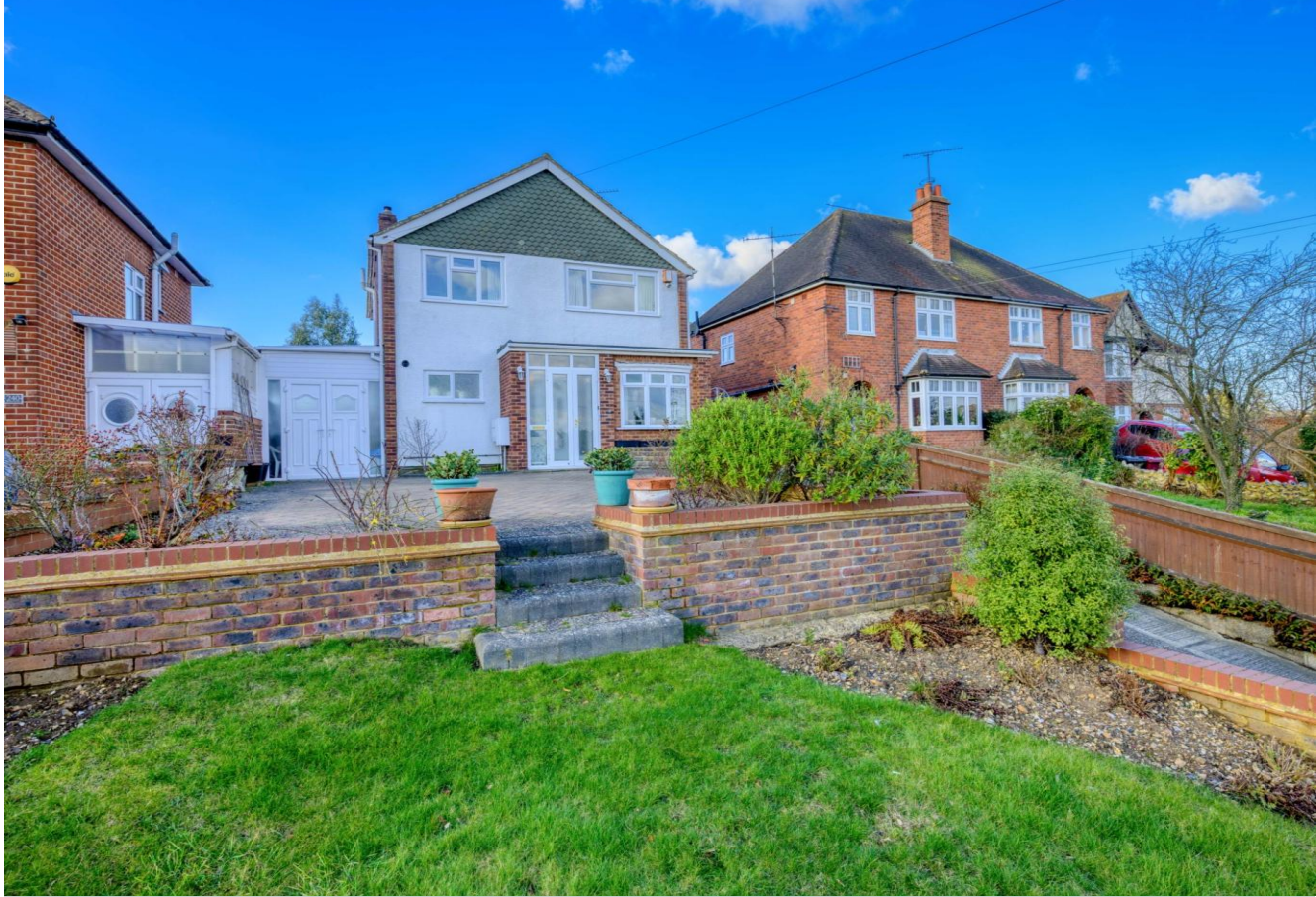
240a Henley Road, Caversham, Reading, RG4 6LR Price £650,000 Freehold