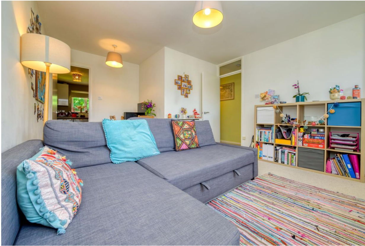
24 The Willows, Caversham, Reading, RG4 8BD Price £260,000 Leasehold (Share of Freehold)

Masons are proud to offer to the market this well presented one bedroom first floor maisonette located in the centre of Caversham and within a stones throw of the River Thames, conveniently located for all local amenities and a short walk to Reading centre and mainline station. This attractive maisonette is ideal for a variety of buyers including first time buyers, people downsizing and investment buyers, the property benefits from a 16ft living/dining room, a modern fitted 13ft kitchen, 11ft bedroom, a modern fitted bathroom suite and allocated parking.