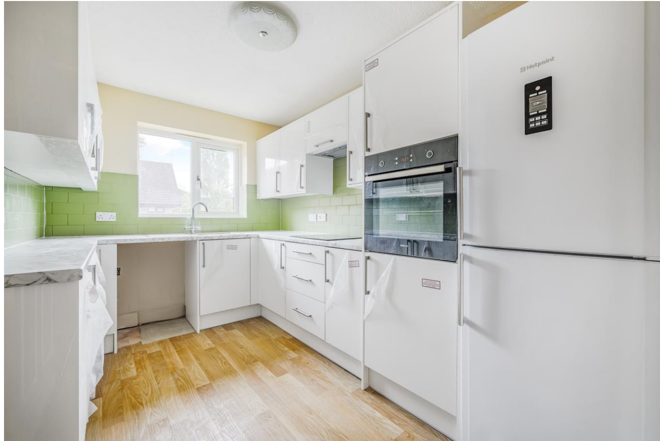
17 Chiltern Court, Emmer Green, Reading, RG4 8RR Price £140,000 Leasehold

Masons are proud to offer to the market this well presented one bedroom first floor (with a stair lift), over 55's retirement apartment situated in the desirable Chiltern Court, close to local amenities including bus stops, St. Barnabas Church, a doctors surgery and local shops in Emmer Green. The property has undergone recent improvements by the current owners including a recently fitted brand new kitchen, new shower room, new carpets and is presented for sale in good condition. The accommodation comprises of a 15ft living room, an 11ft dining room, an 11ft modern kitchen, an 11ft bedroom with built in storage and a new shower room. Further benefits include UPVC double glazing, landscaped communal gardens with ample seating areas, residents and visitors parking and the property is offered for sale with NO ONWARD CHAIN. VIEWING RECOMMENDED.