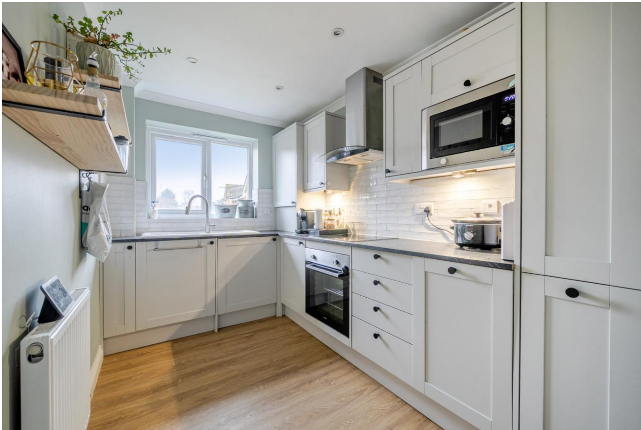
Milestone View Court, Lowfield Road, Caversham Park, Reading, RG4 6ND Price £245,000 Leasehold

Masons are proud to offer to the market this immaculately presented, modern two bedroom first floor apartment situated within close proximity to Sonning, Henley on Thames, Caversham & Reading centres along with Reading mainline station. The property has undergone recent improvements by the current owners including a new kitchen and modern family bathroom along with a redecoration throughout. The accommodation comprises of a 17ft living room, an 11ft modern kitchen, an 11ft master bedroom, a 10ft second bedroom and a high specification modern family bathroom. Further benefits include loft storage, gas central heating, UPVC double glazing, allocated parking and a communal garden. VIEWING RECOMMENDED.