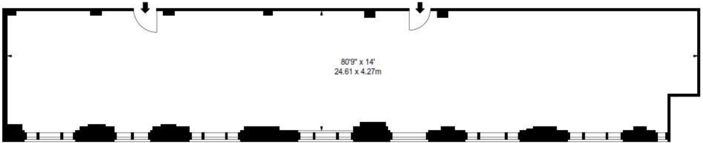
ILLUSTRATION FOR IDENTIFICATION PURPOSES ONLY. NOT TO SCALE * As Defined by RICS - Code of Measuring Practice

APPROX. GROSS INTERNAL AREA * 1122 Ft 2 - 104.23 M 2