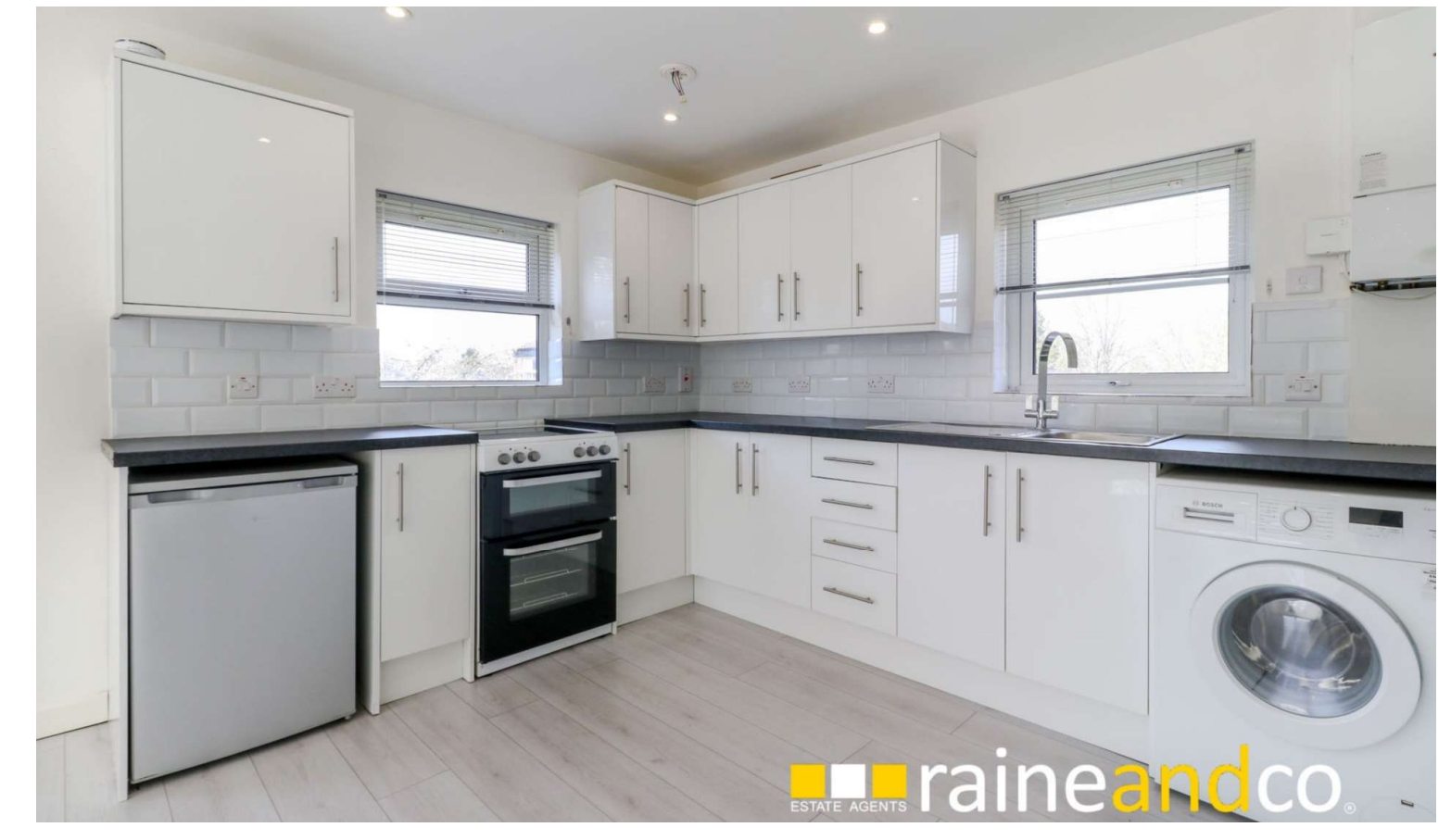
BUY TO LET INVESTMENT CLOSE TO TRAIN STATION AND TOWN CENTRE. Purpose built second (top) floor flat is situated in a convenient location.