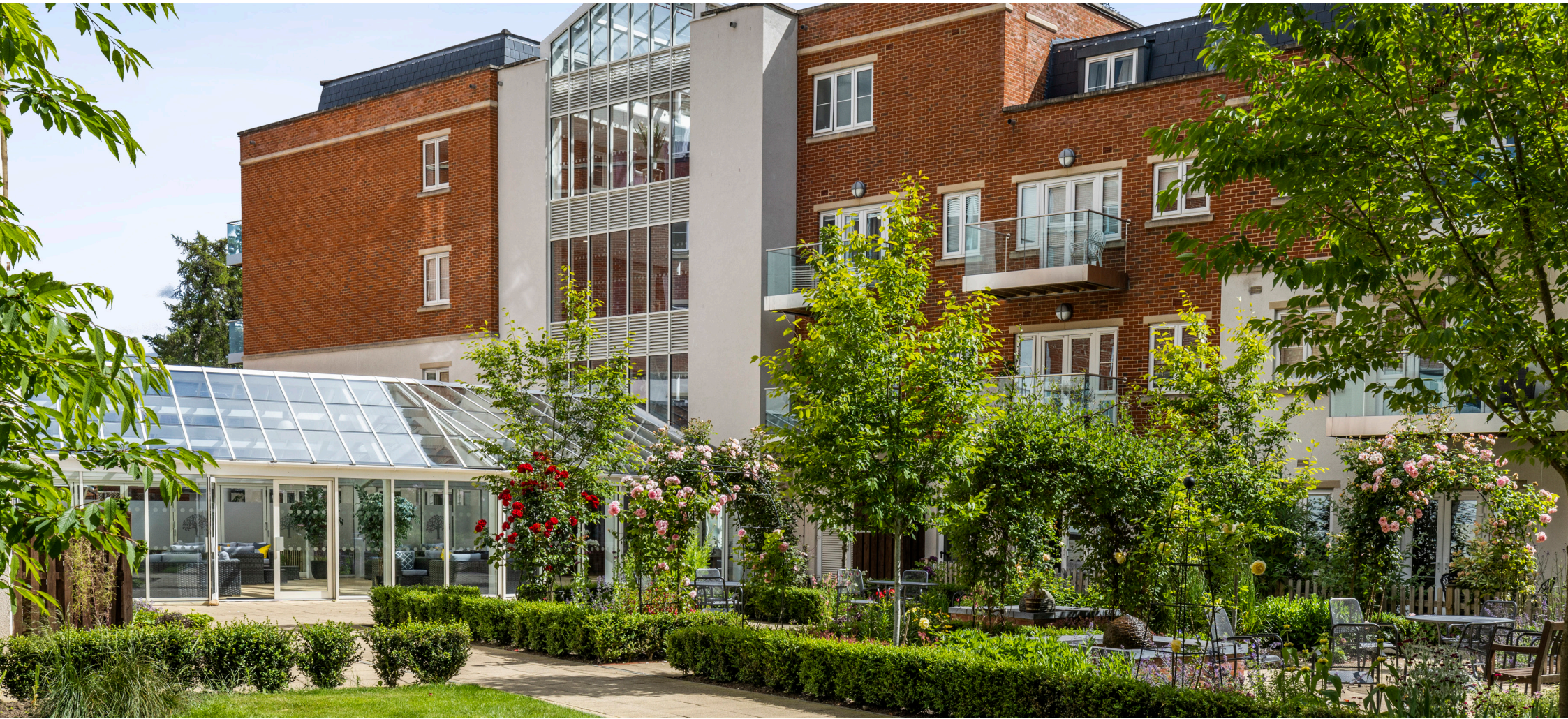
Cedar Lodge, Ascot