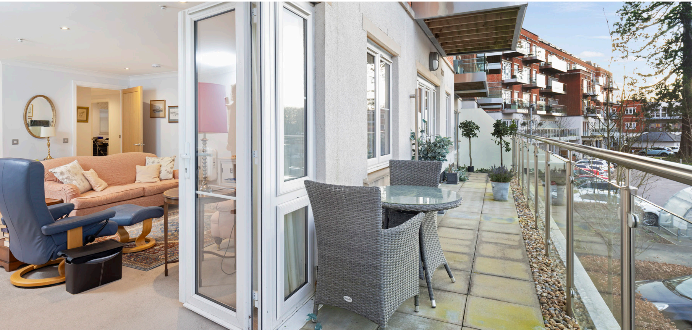
Mulberry House, Ascot