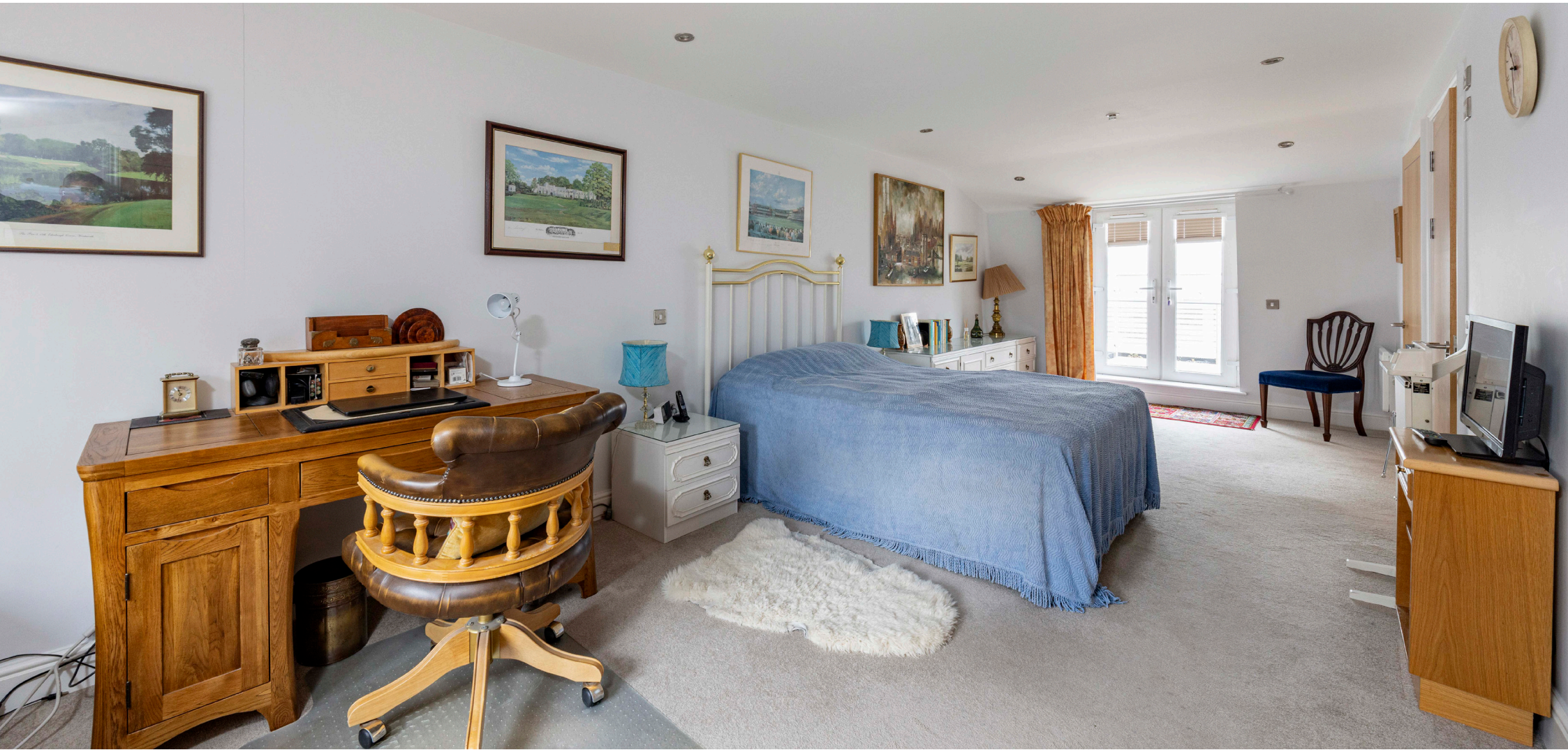
Mulberry House, Ascot