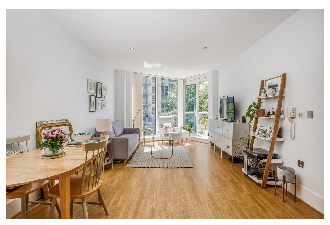
Living Area Commodore House, Juniper Drive, Wandsworth, SW18 1TW