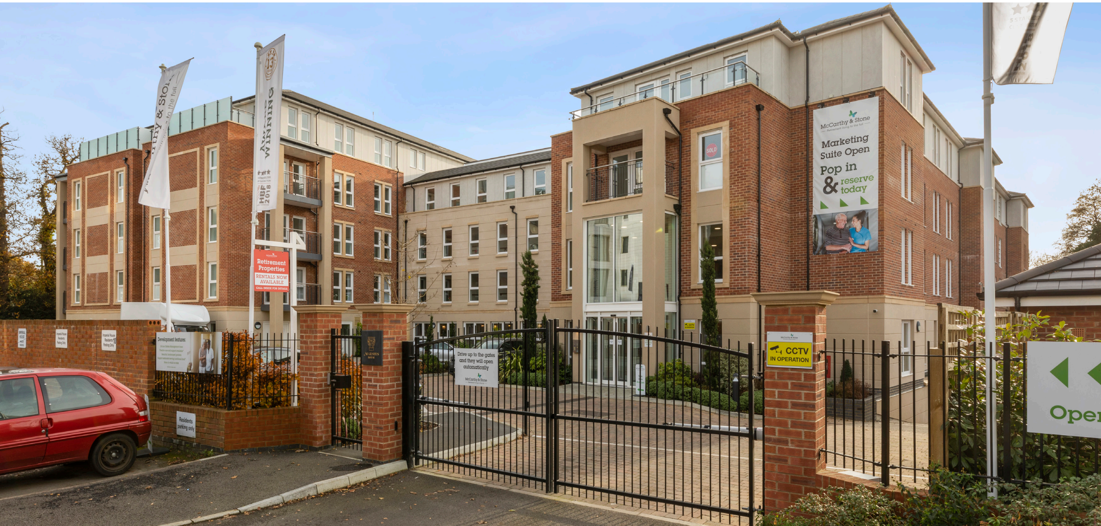
Augustus House, Virginia Water