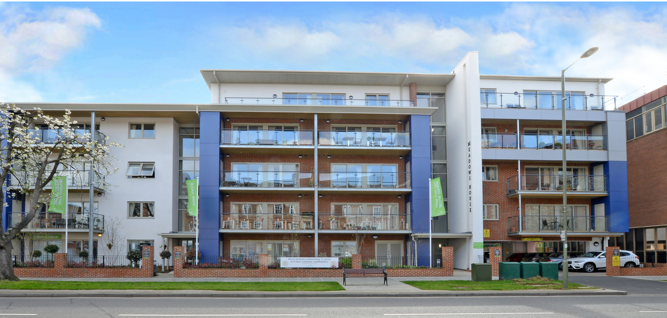
Meadows House, Walton