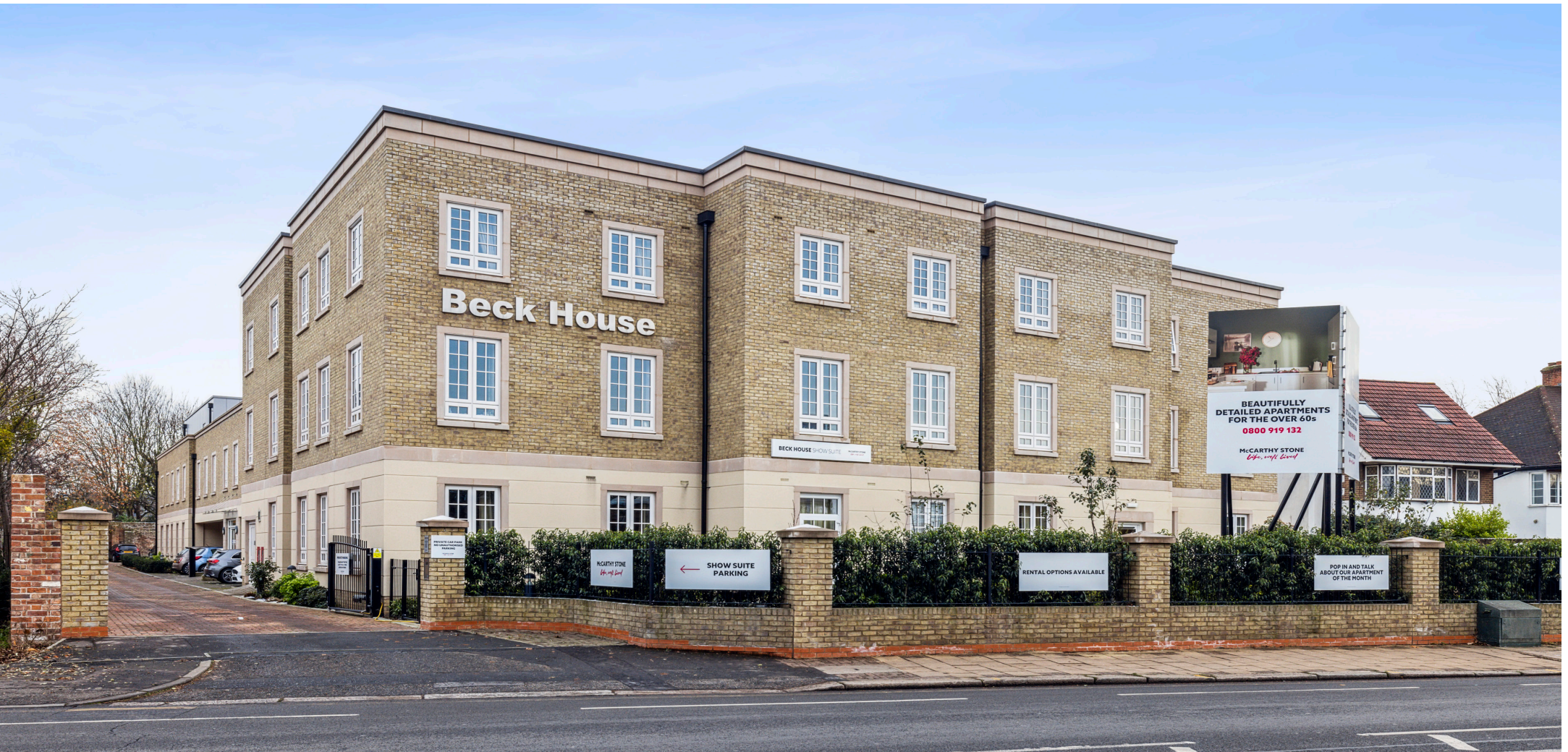
Beck House, Isleworth