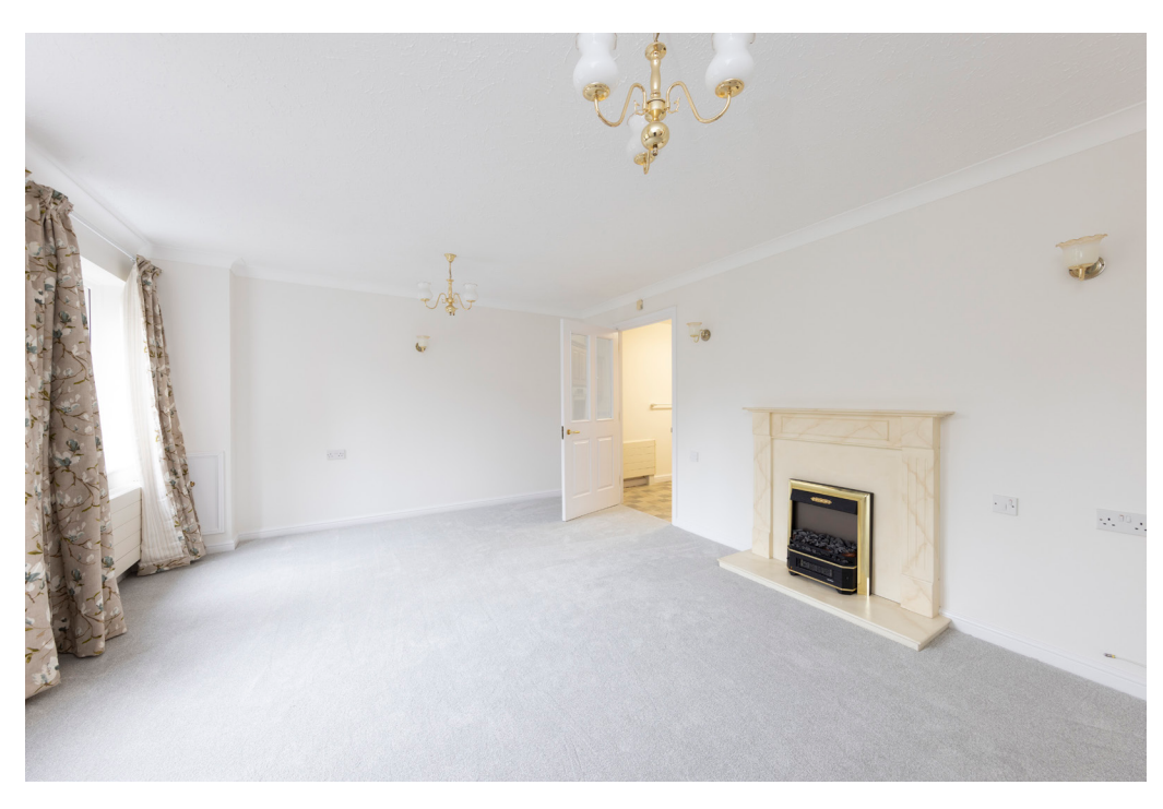
Living Area Fullerton Court, Udney Park Road, Teddington, TW11 9BF