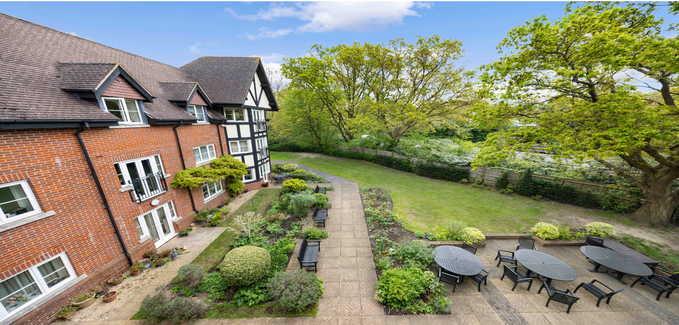
Hinchley Manor, Esher