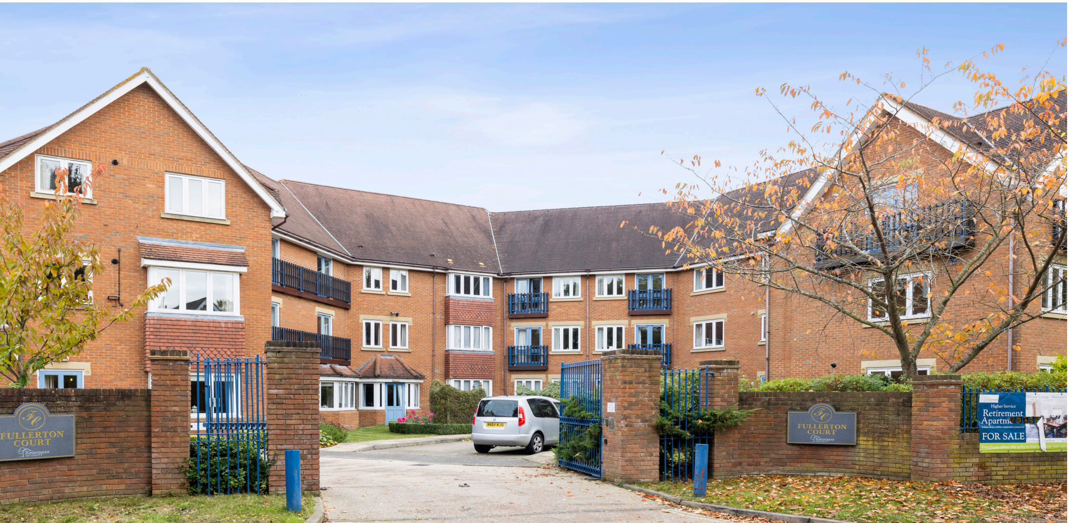
Fullerton Court, Teddington