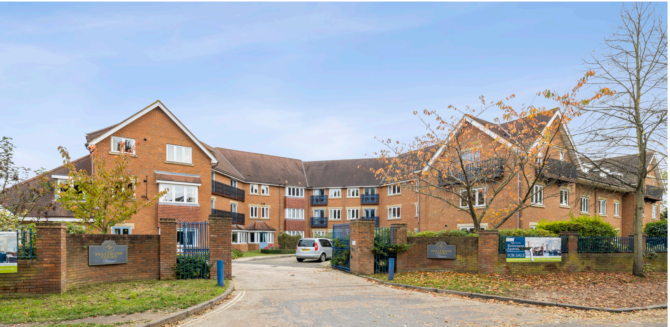
Fullerton Court, Teddington