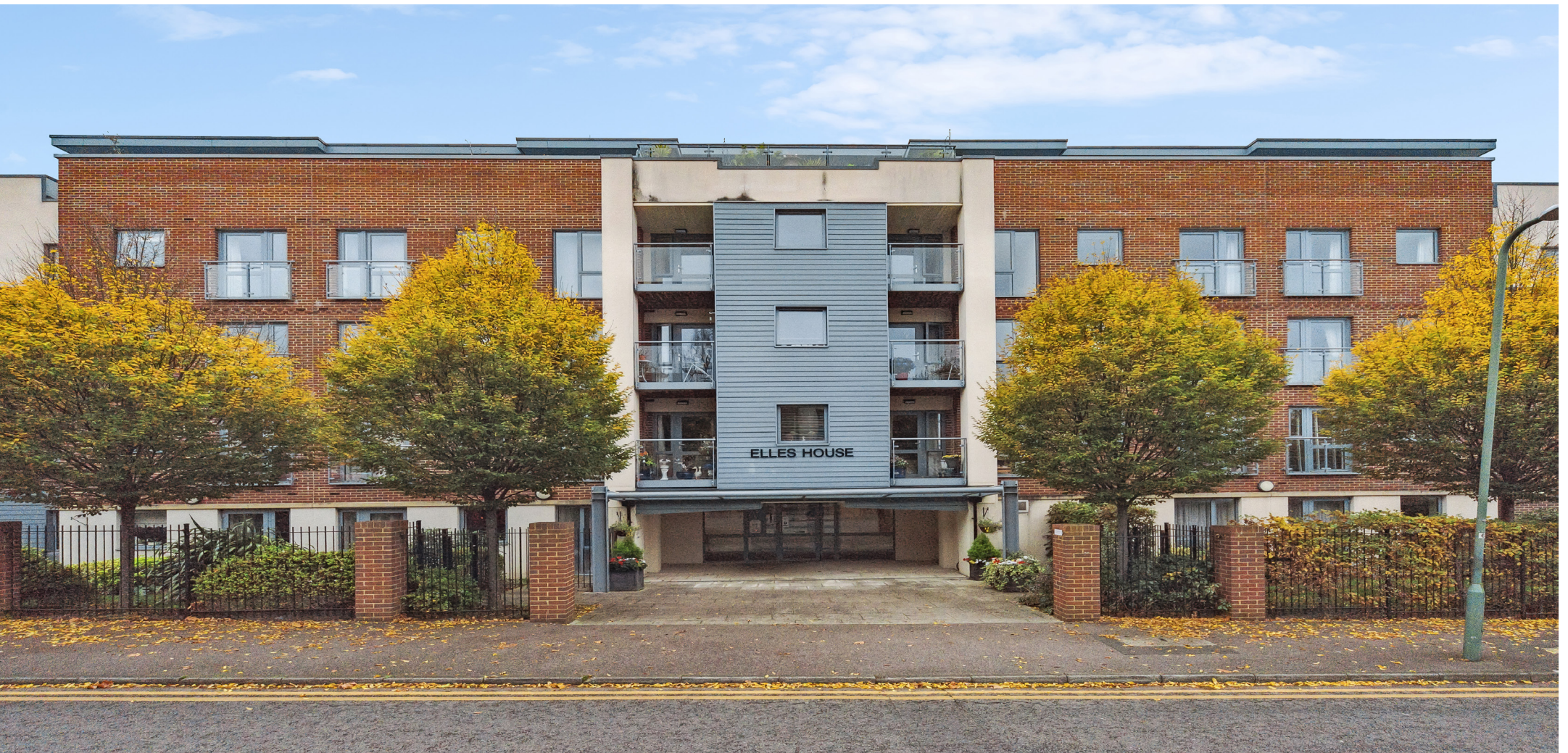
Elles House, Wallington