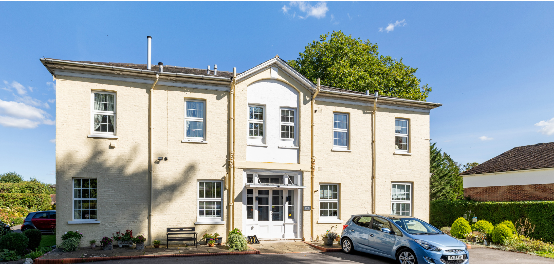
Grove House, Windsor