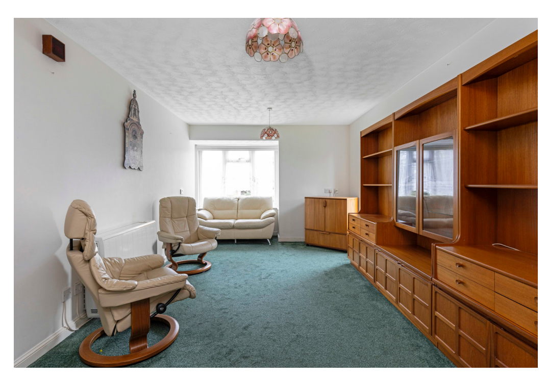
Living Area Cedar Court, Crockford Park Rd, Addlestone, Surrey, KT15 2LQ