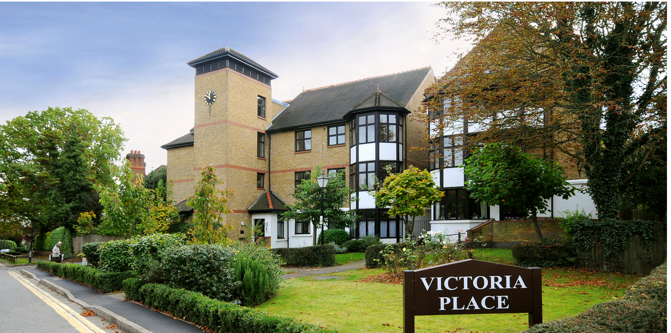
Victoria Place, Esher