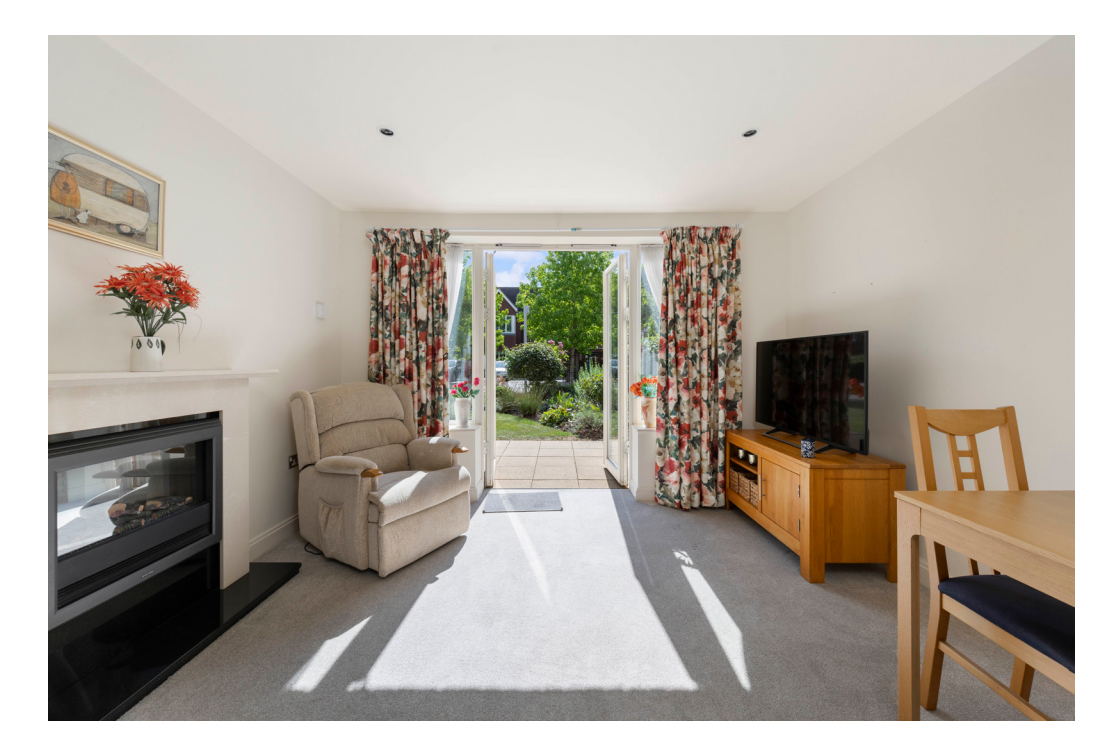
Living Area Hampshire Lakes, Oakleigh Square, Hammond Way, Yateley