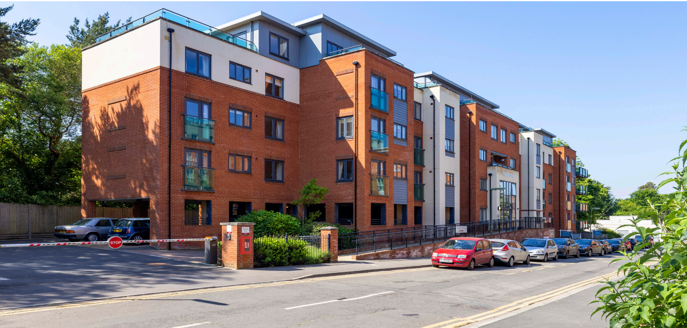
Stokes Lodge, Camberley