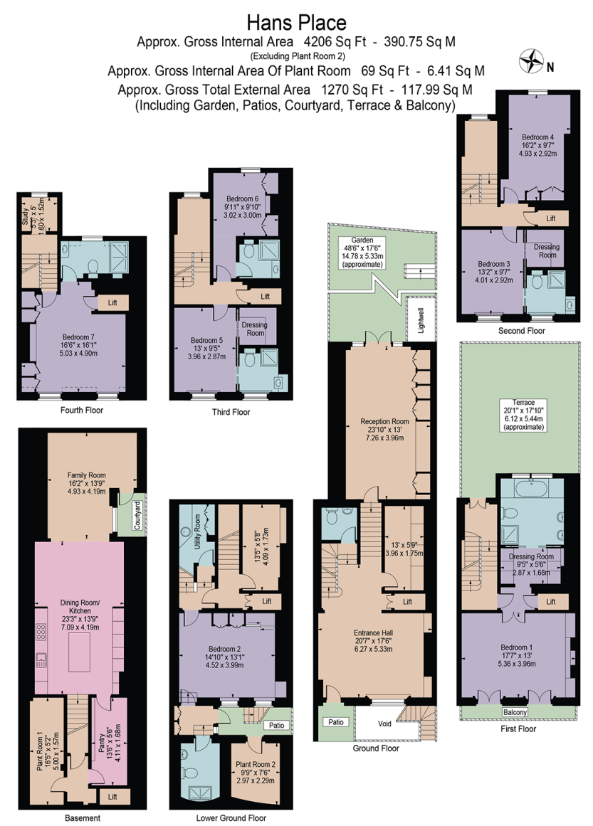
For Illustration Purposes Only - Not To Scale

This floor plan should be used as a general outline for guidance only and does not constitute in whole or in part an offer or contract. Any intending purchaser or lessee should satisfy themselves by inspection, searches, enquiries and full survey as to the correctness of each statement. Any areas, measurements or distances quoted are approximate and should not be used to value a property or be the basis of any sale or let.