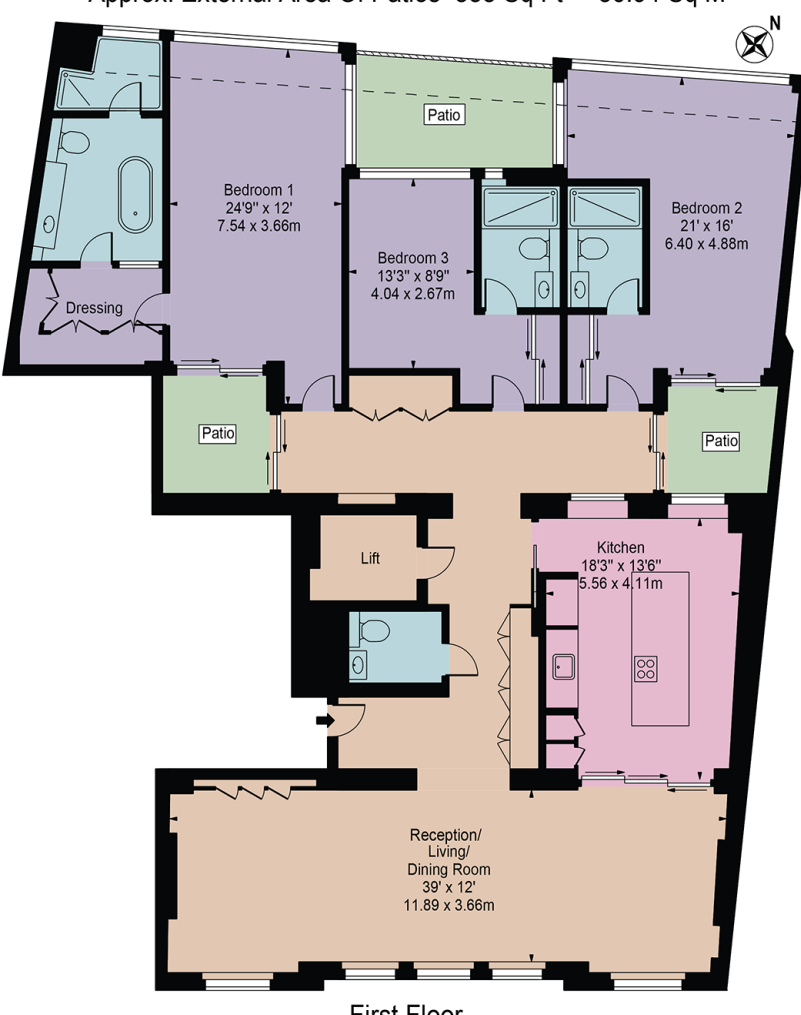
First Floor For Illustration Purposes Only - Not To Scale

Approx. Gross Internal Area 2243 Sq Ft - 208.38 Sq M Approx. External Area Of Patios 333 Sq Ft - 30.94 Sq M