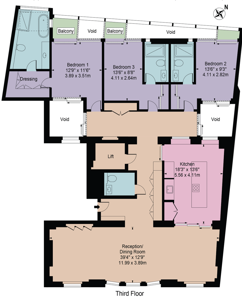
For Illustration Purposes Only - Not To Scale

Approx. External Area Of Balconies 72 Sq Ft - 6.69 Sq M