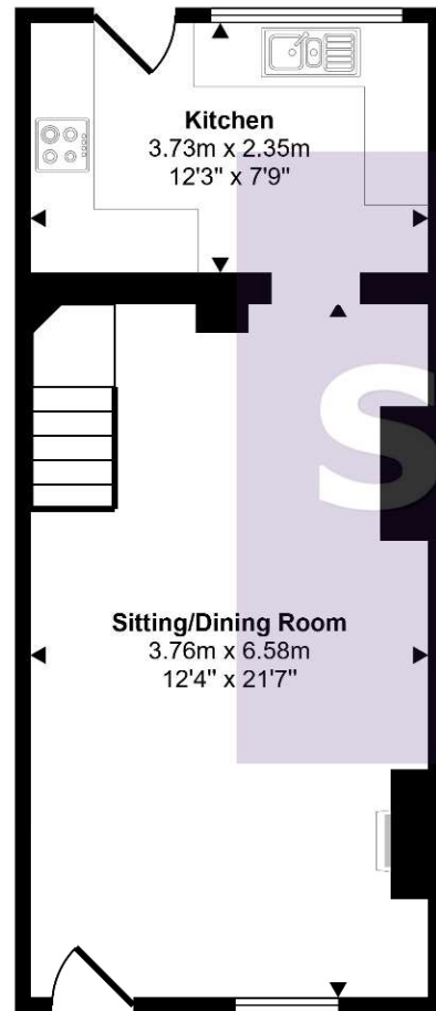
Ground Floor Approx 35 sq m / 373 sq ft

Approx Gross Internal Area 73 sq m / 788 sq ft