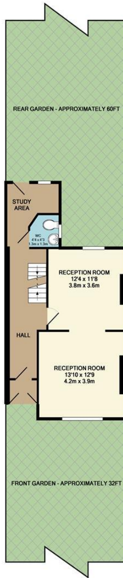
GROUND FLOOR APPROX. FLOOR AREA 514 SQ.FT. (47.7 SQ.M.)