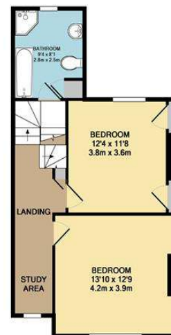
1ST FLOOR APPROX. FLOOR AREA 511 SQ.FT. (47.5 SQ.M.) NORTH ROAD TOTAL APPROX. FLOOR AREA 1688 SQ.FT. (156.8 SQ.M.) Measurements are approximate. Not to scale. Illustrative purposes only. Made with Metropix ©2013