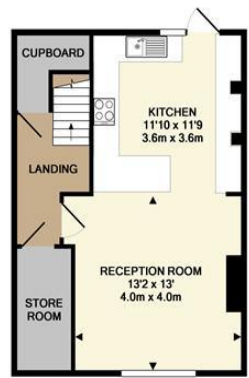
LOWER GROUND FLOOR APPROX. FLOOR AREA 433 SQ.FT. (40.2 SQ.M.)