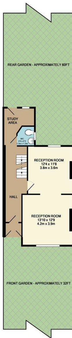
GROUND FLOOR APPROX. FLOOR AREA 514 SQ.FT. (47.7 SQ.M.)