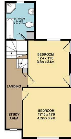
1ST FLOOR APPROX. FLOOR AREA 511 SQ.FT. (47.5 SQ.M.) NORTH ROAD TOTAL APPROX. FLOOR AREA 1688 SQ.FT. (156.8 SQ.M.) Measurements are approximate. Not to scale. Illustrative purposes only. Made with Metropia ©2013