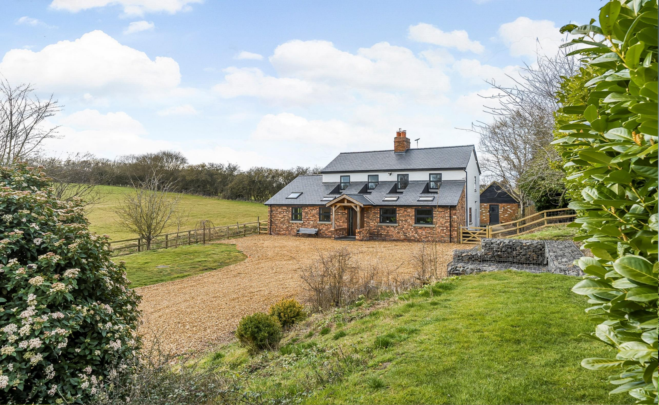
“Railway Cottage” Back Lane, Souldrop, Bedfordshire MK44 1HQ