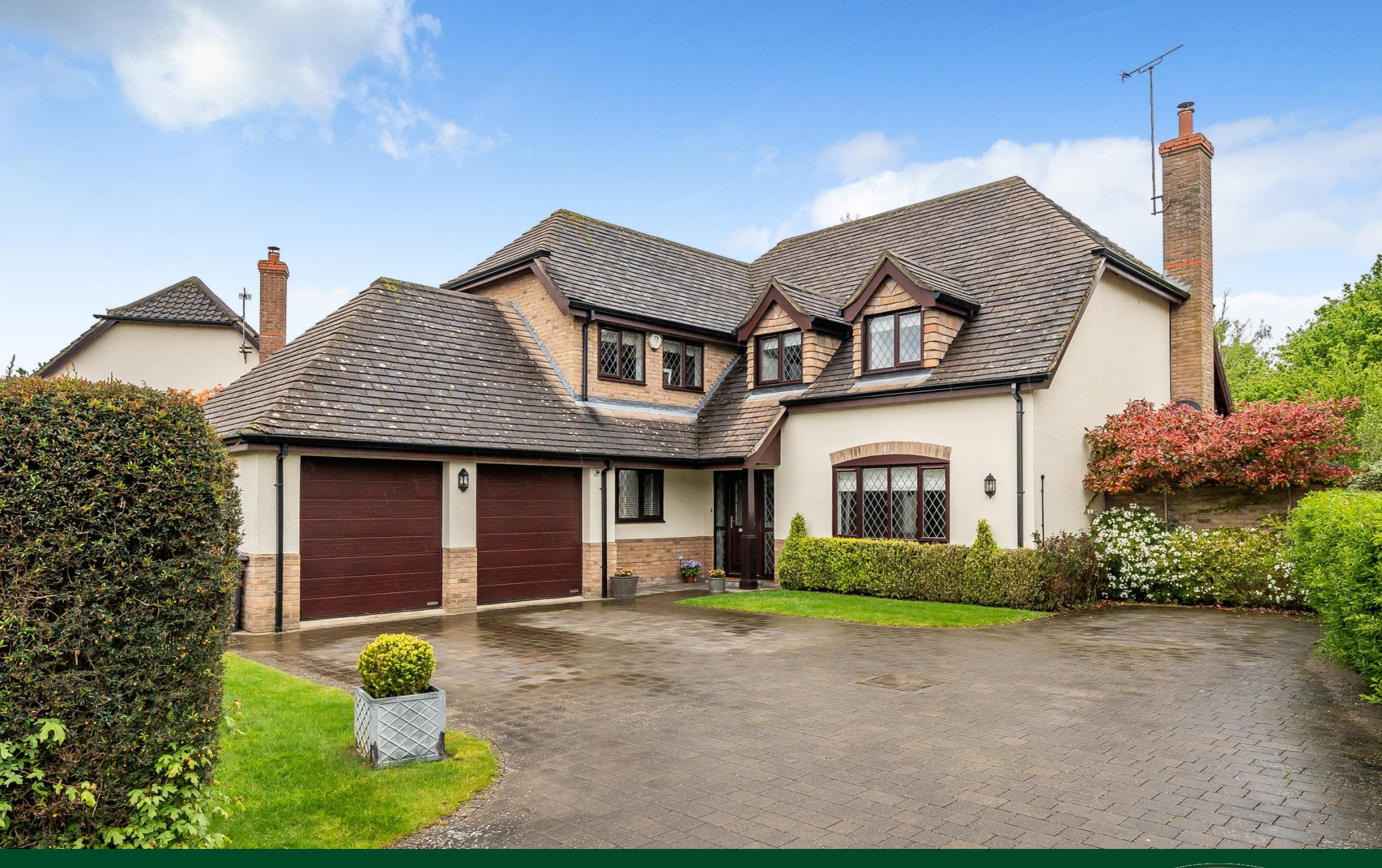
14, Lavenham Drive, Deep Spinney, Biddenham, Bedfordshire MK40 4QX