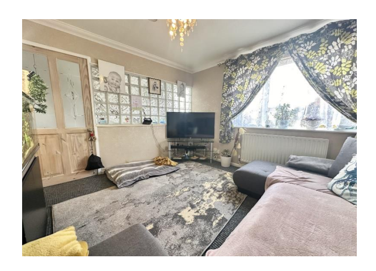
Manually enter text or bullet points