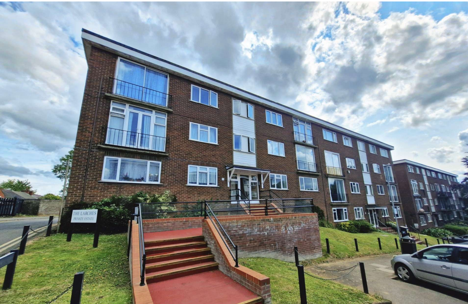
Spacious 2-Bedroom Flat Near Luton Train Station & Wardown Park – With Garage

Situated in a highly convenient location just a short walk from Luton Train Station and the picturesque Wardown Park, this well-presented two-bedroom flat offers both comfort and practicality in equal measure.